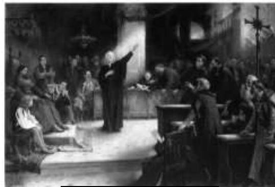
At the declaration of Turda

In sixteenth century Transylvania, Francis David (1510-1579) became the founder of the first Unitarian faith to be known literally as Unitarian. Francis David had originally trained as a Catholic priest before becoming a Lutheran and then a Calvinist, and then finally a Unitarian. In the year 1568, King John Sigismund called a Diet (debate) in the city of Turda to determine which of the established religions in the area would be declared the official religion of his realm. During that lengthy debate, Francis David held his ground against all the other established religions in the region and convinced King John Sigismund that to declare one religion as the state religion and to compel his people to follow that religion was wrong. King John proclaimed religious freedom throughout his realm, the first such declaration known in history. This victory did not last long, within three years King John was dead, and his successor did not hold his tolerant views. Francis David was ultimately sentenced to prison for refusing to acknowledge that Jesus Christ was to be at least Adored, and he died in the prison at Deva in 1579. The Unitarian faith that Francis David founded is still alive today amongst many of the ethnic Hungarians living in the Transylvania region.