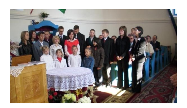
Presentation of Youth from Benced