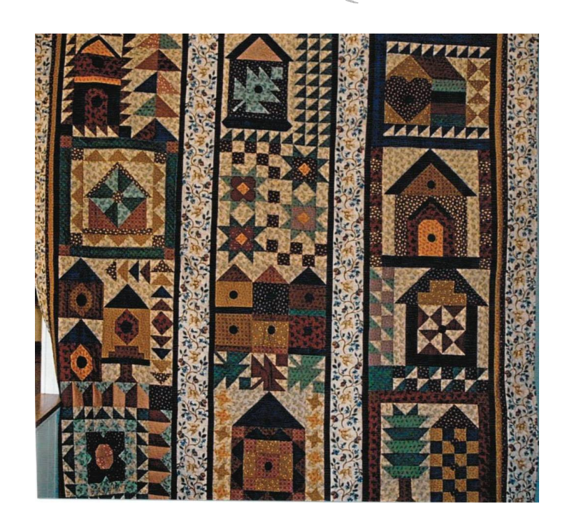
Home "Tweet" Home in beautiful earth tones

If you haven't already finished selling your raffle tickets, please do so immediately and turn them in by September 11th <u>before the service</u>. The drawing will be held during the service.